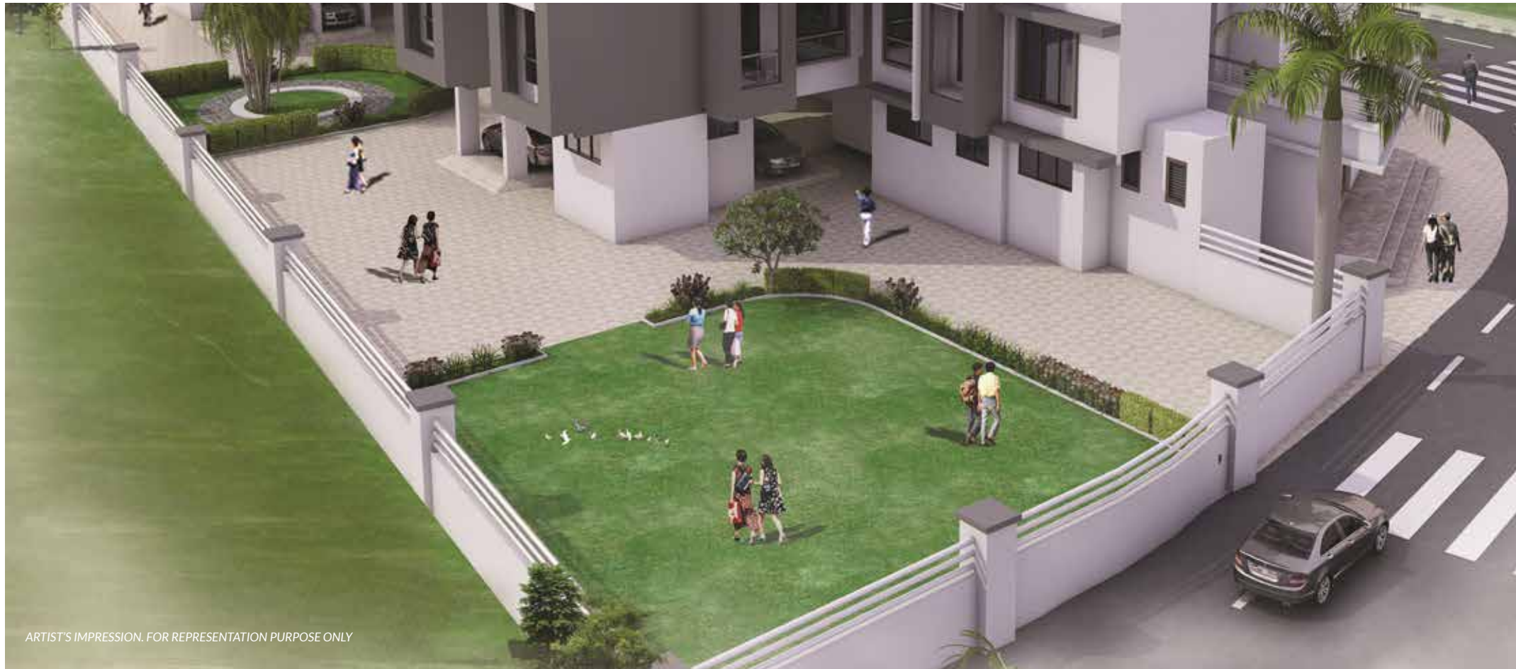
ARTIST'S IMPRESSION. FOR REPRESENTATION PURPOSE ONLY