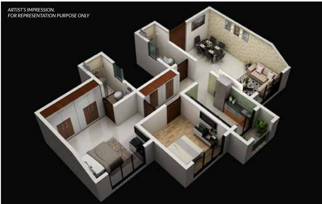
ISOMETRIC VIEW: 2BHK APARTMENT