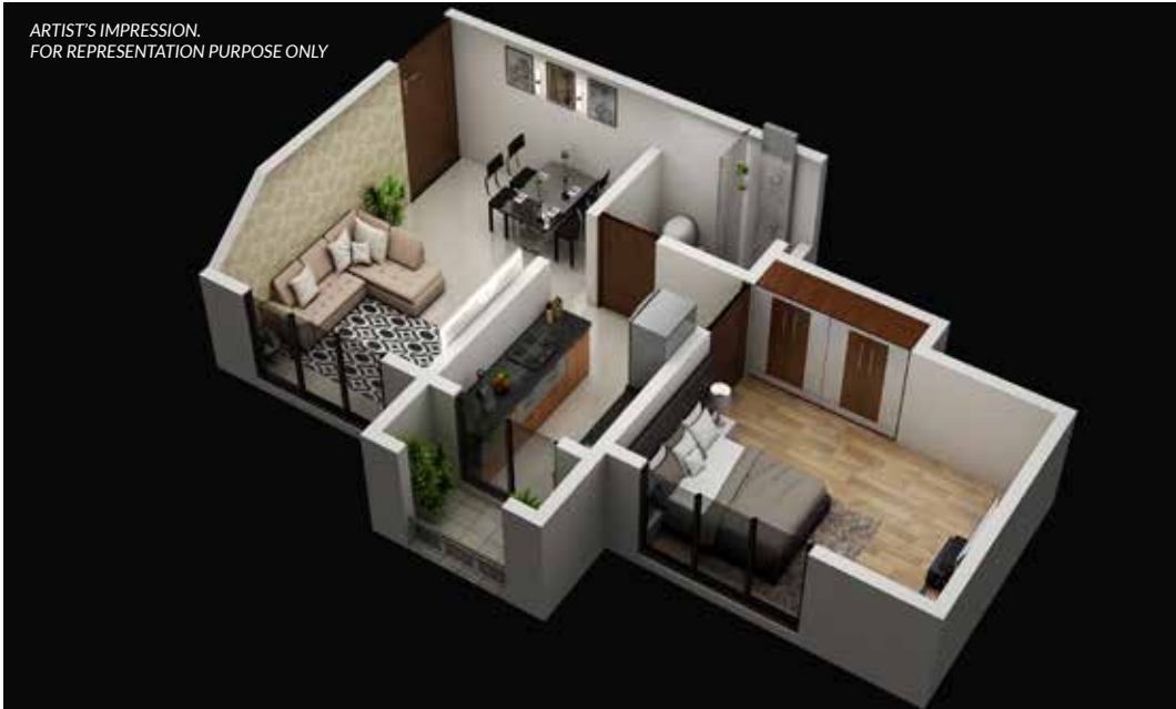
ISOMETRIC VIEW: 1BHK APARTMENT